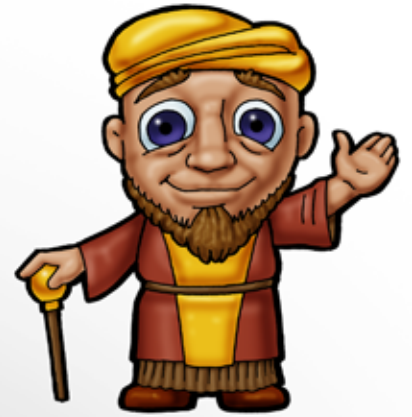
Businessman from Ur

Job was a great believer. In a short period of time his children, wealth and health were taken away from him. His stability through this trial will all depend on his knowledge of God and if he can apply those truths to his situation. In return, God will restore to Job all he lost and more.